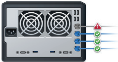
Figure 2) Resilient and Reliable

Multiple LAN ports with link aggregation support allows DS1513+ to deliver superior performance.